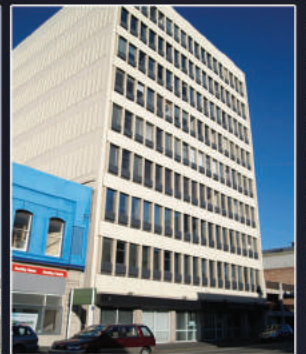
Avalon Studios - Wellington | Otago Radio House - Dunedin